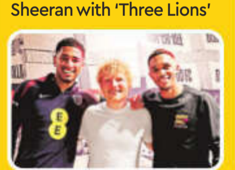
Sheeran with 'Three Lions'

Singer Ed Sheeran performed a secret gig for the England squad in Kansas City and backs the Three Lions to reach the finals, predicting their opponents to be two-time champions France, led by Kylian Mbappe.