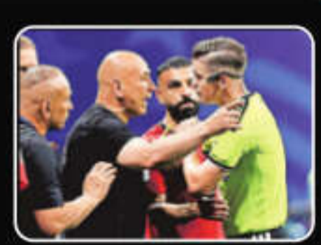
ignited discussions over refereeing calls and FIFA's management of the WC.